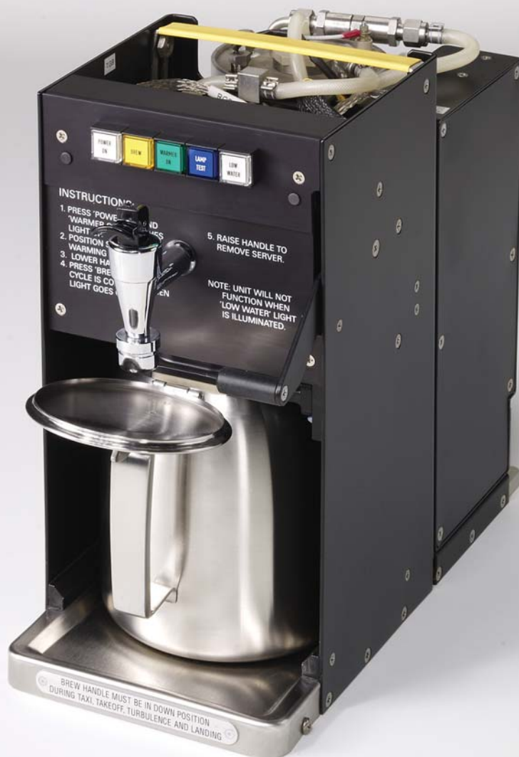
E-series • P/N 64771-001-003

Designed for the preparation of tea or instant coffee, our low maintenance E-series beverage maker features rapid reheat cycles and low power consumption.